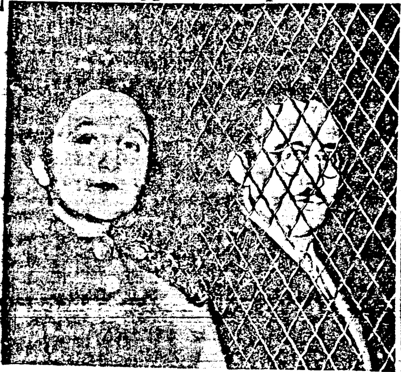
CONVICTIONS UPHeld—Ethel and Julius Rosenberg on way to jail and jail